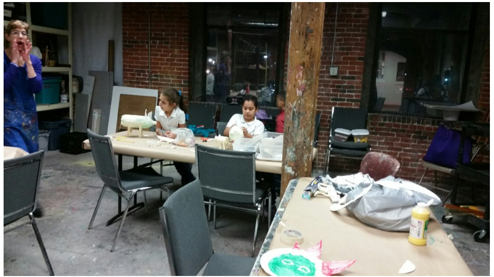
Students work on their art projects at their weekly visit to the Essex Art Center