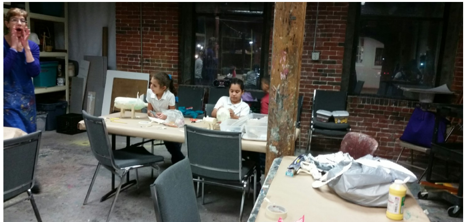
Los estudiantes trabajan en sus proyectos de arte en su visita semanal al Essex Art Center.