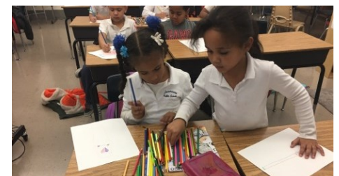
Los estudiantes trabajan en el diseño de sus propios palos de llovias.

La tercera sesión se inició el lunes 28 de marzo con algunos nuevos programas incluyendo Construir con Chrome, Sistema Solar, Los Planetas y La Exploración, y el Scrapbooking. Los estudiantes también irán fuera del sitio para las actividades de diversión en el Centro de Arte de Essex, a nadar en el Club de Niños y Niñas, y para actuar en el Acting Out. ¡No podemos esperar a ver todas las cosas nuevas que los estudiantes aprenderán esta sesión!