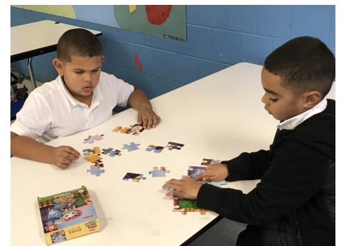
Los estudiantes ponen su razonamiento de habilidades de trabajar reuniendo un rompecabezas.

Este año, los estudiantes participarán en un currículo lleno de nuevas experiencias y oportunidades. Ofrecemos clubes especiales para todos nuestros programas, incluyendo: "SPARK" actividades, tambores, nuevos juegos físicos y actuación. Un club que estamos muy emocionados es el programa de Girl Scouts, que las niñas en todos nuestros programas tendrán la oportunidad de participar. Otro club que estamos trabajando para llevar a todos nuestros programas es el fútbol. ¡Los niños de nuestro programa tendrán muchas oportunidades este próximo año escolar y estamos muy emocionados de ser parte de todo!