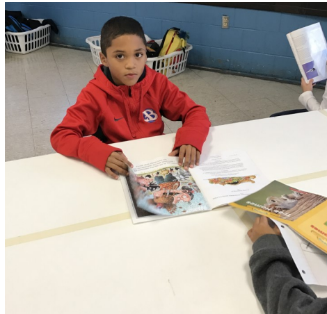
Students practice their reading at the Latchkey After School Enrichment Program.

"Education is the most powerful weapon which you can use to change the world." - Nelson Mandela