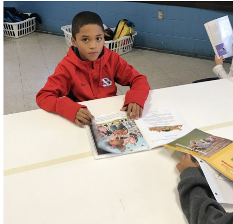
Los estudiantes practican su lectura en la Programa de Enriquecimiento de Latchkey.