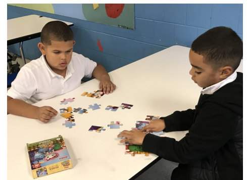
Students put their reasoning skills to work putting together a puzzle.