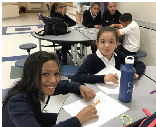
Latchkey students were hard at work during Homework Club.

The Extended Learning Time program is in full swing at the Guilmette school! Focusing their enrichment programs around an African theme, students are creating their own African masks and instruments during African Art and making African legends come to life in Storytelling. Spark, our team building and cooperative play program is teaching students to move like jungle animals. And the African beats that are coming out of the Drumming class are incredible!